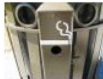
Side Mounted Ash Urn: