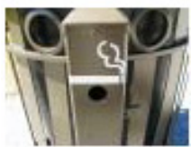
Side Mounted Ash Urn: