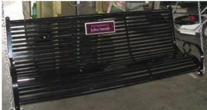
2nd. Plaque Option