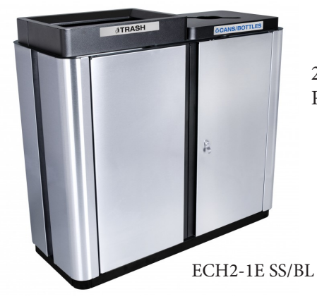
2 or 3 Stream Indoor Receptacles

These receptacles features a contemporary, sleek design with satin stainless steel bodies and black anodized aluminum trim.