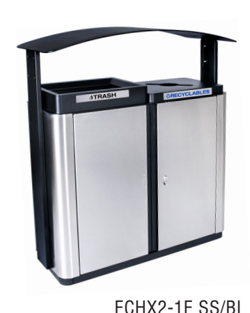
2 or 3 Stream Outdoor Receptacles w/Sturdy Powder Coated Aluminum Canopy