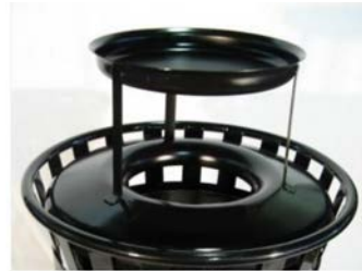
LG Rain Guard, Covered Removable Ash Urn