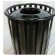
LG Rain Guard, Removable Ash Urn