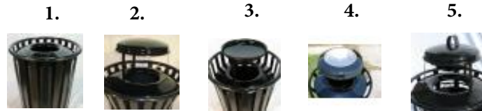
Side Mounted Ash Urn Option