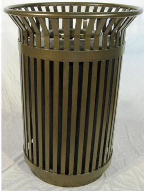
Side View Showing Pedestal Mount