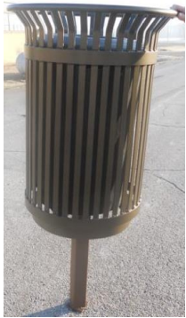
Close-up view of the pedestal mount.