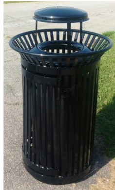
Side View Showing Pedestal Mount