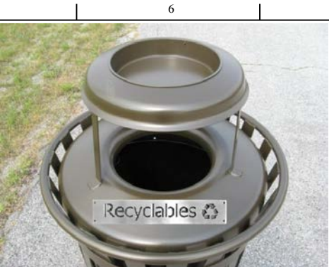
Optional Removable Ash Urn Top with optional "Recyclables Plaque"