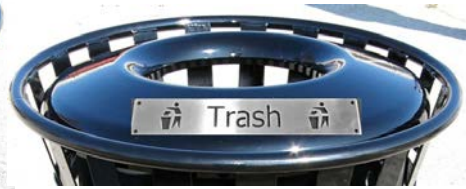
Optional "Trash" Plaque