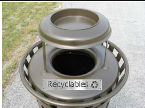
Optional Removable Ash Urn Top with optional "Recyclables Plaque