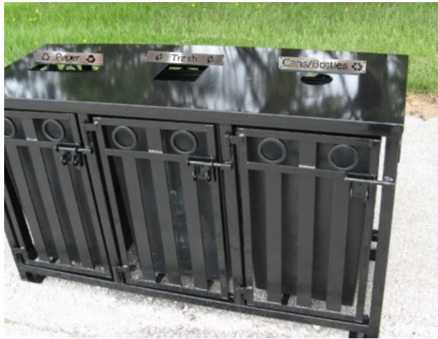
Black Receptacle w/Steel Top